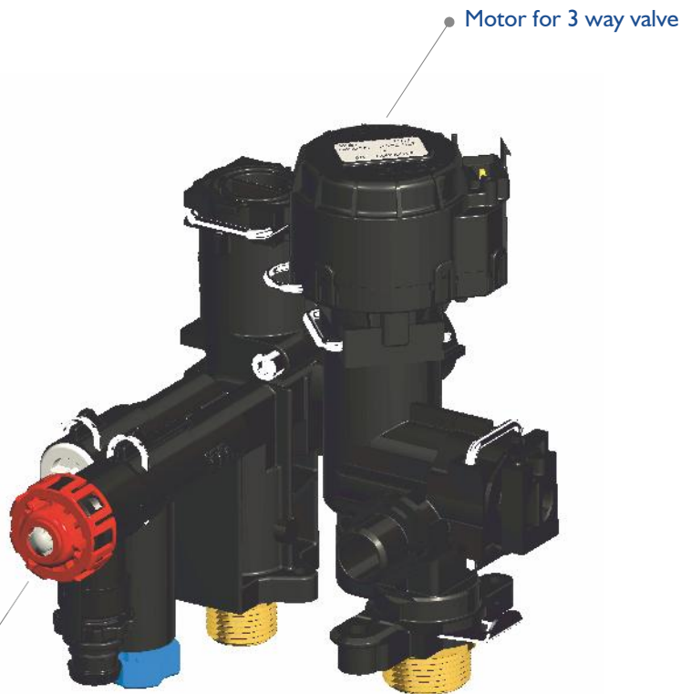
Pressure relief valve 3 bar